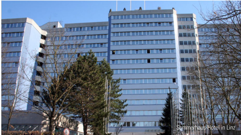
Sommerhaus-Hotel in Linz