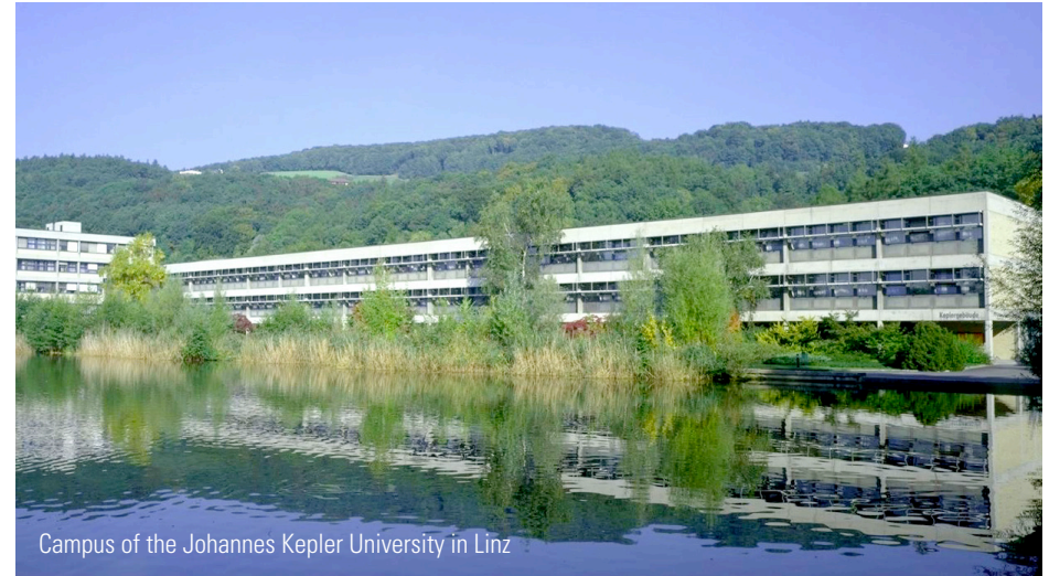
Campus of the Johannes Kepler University in Linz

mobility mICC International Camp on Communication & Computers for people with motor disabilities