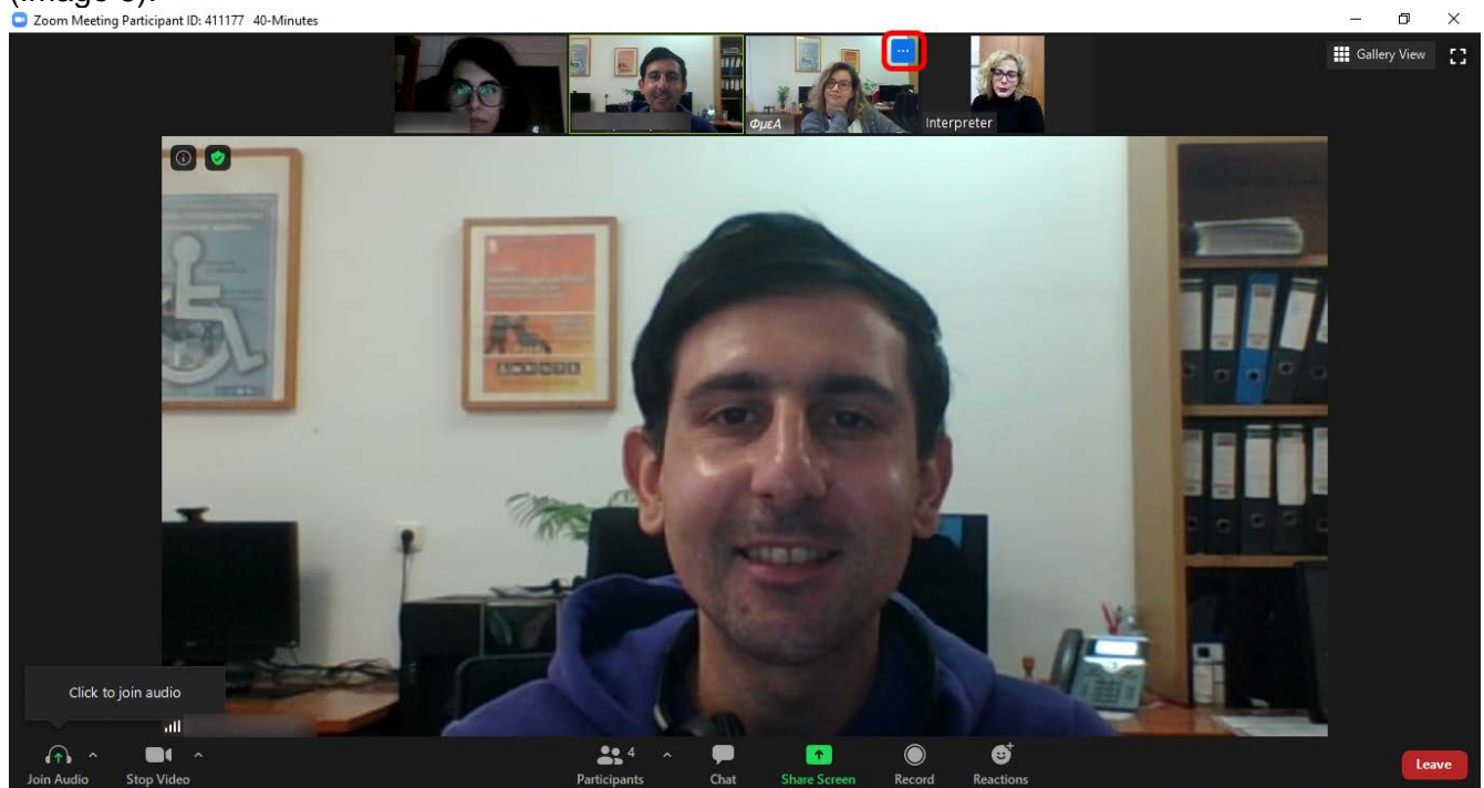
Image 5. Click on the icon with the three dots_SwD