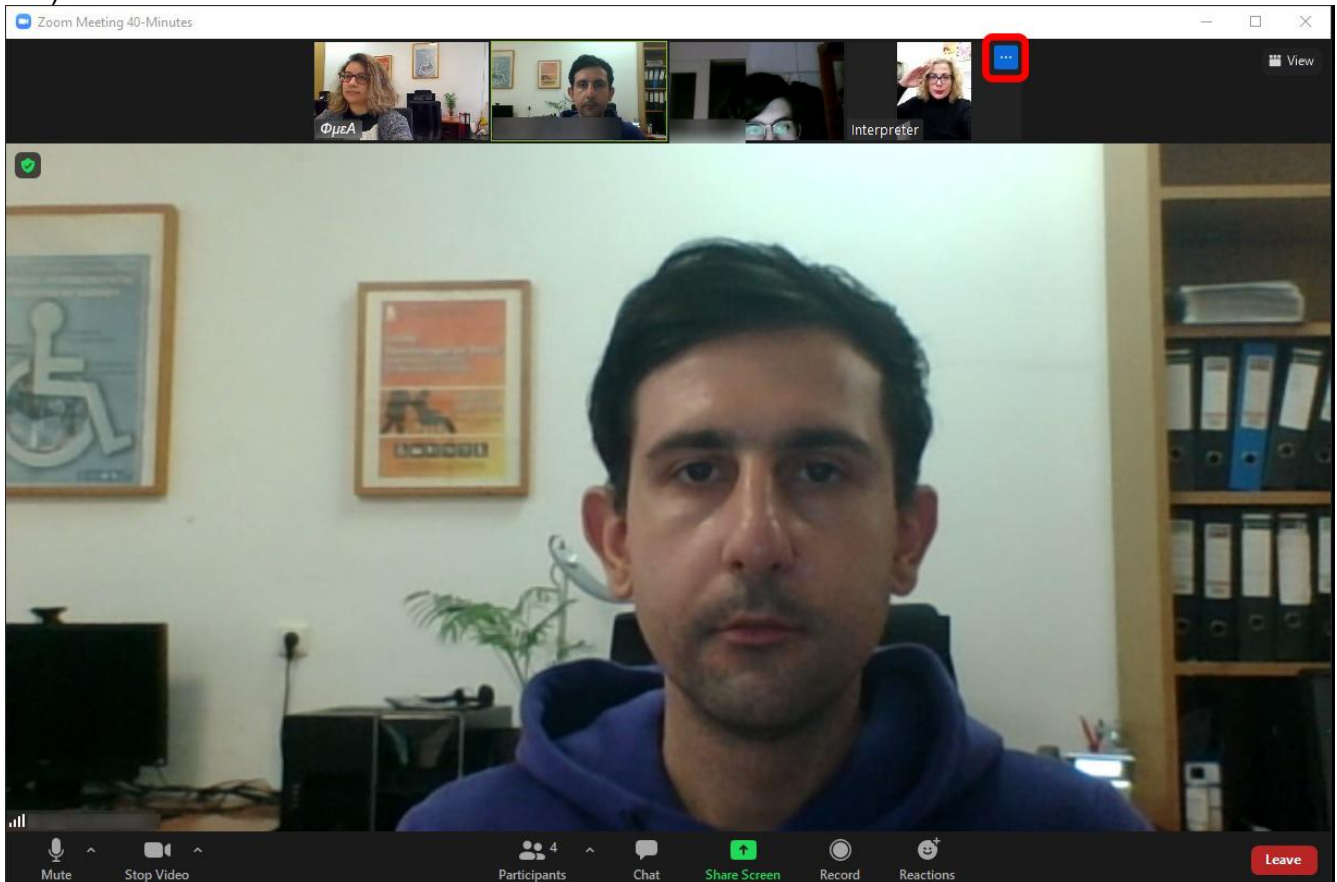
Image 1. Select the icon with the three dots_Interpreter